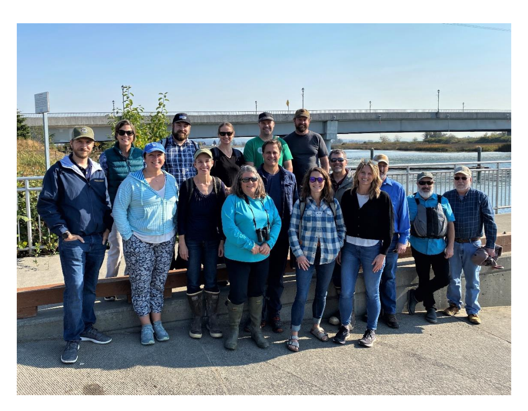
PMEP partners at 2022 midyear meeting in Marysville, Washington.