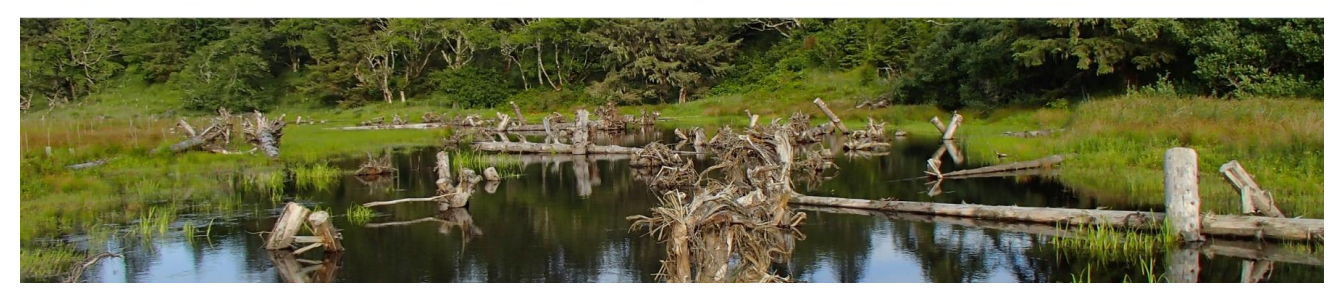
Approved by the PMEP Steering Committee October 4, 2022